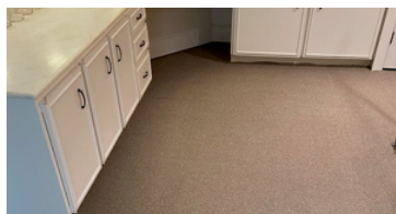
New Carpet in Music & Bride Rooms

The mission of the Church of the Good Shepherd is "Changing Lives, Sharing Christ." Your financial commitment to our church helps us do exactly that. Here are some ways your support has helped us in our mission in the last quarter.