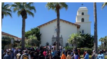
Martin Luther King Day Celebration